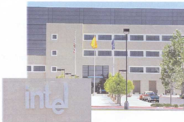
Intel is a clear example of an economic base employer.

Base employment plays a vital role in developing and maintaining a healthy economy in fast growing communities such as Rio Rancho. Base employment is comprised of those employers within the community that make products and provide services that are sold outside the local economy.